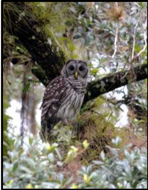
We felt like we were being watched, and indeed we were !