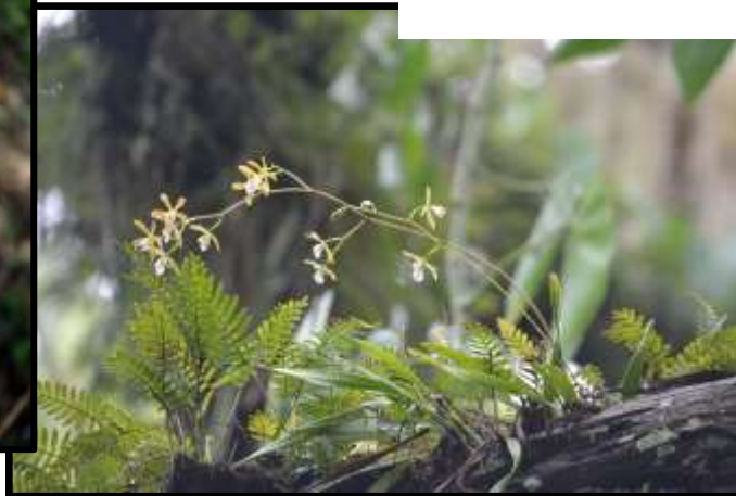
Butterfly orchid ( Encyclia tampensis ) Voucher specimen collected to fill in the gap for St Lucie County https://florida.plantatlas.usf.edu/Plant.aspx?id=2477