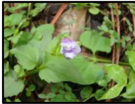
Browne's Savory ( Clinopodium brownei )

This was one of several species of which we collected a voucher specimen – to fill in that data gap for St Lucie County